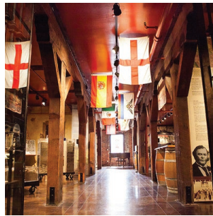
Bartholomew Park Winery