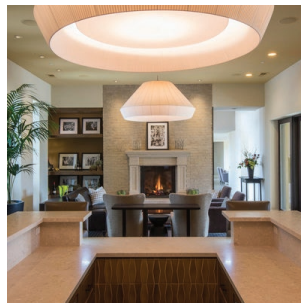
Patz & Hall