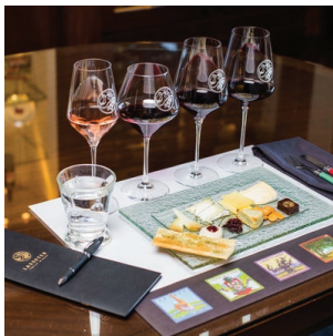
Lasseter Family Winery