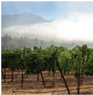
St. Francis Winery & Vineyard