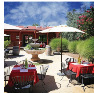
Paradise Ridge Winery